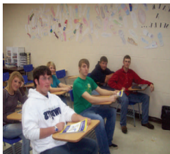
Silo GEAR UP Students