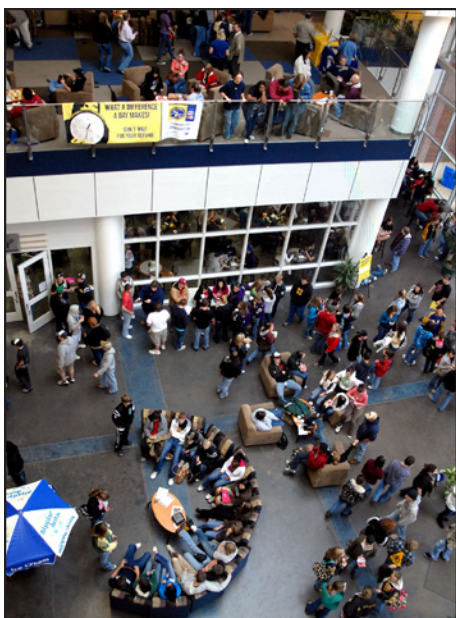
High school students gather in the Student Union at the 96th Curriculum Contest.

Southeastern Oklahoma State University hosted the 96th annual Curriculum Contest Thursday with 70 high schools participating.