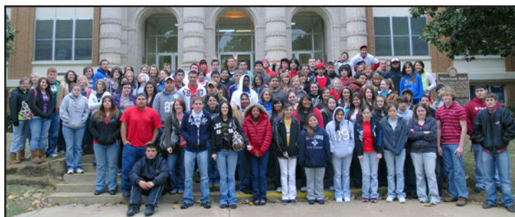
Participants in the Native American Student Visitation Day gather for a group photo.