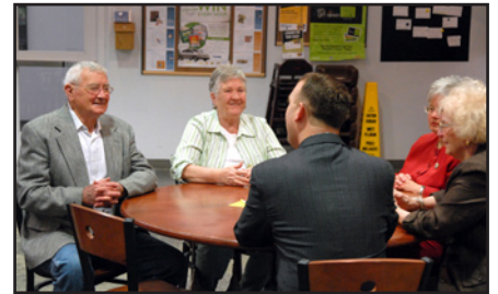
Alumni enjoyed breakfast at the new Student Union cafe.