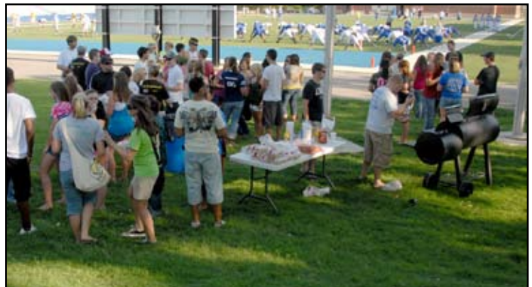
Students enjoy a cookout prior to the scrimmage.

Fall classes began at Southeastern on Monday, Aug. 17. Prior to that, a number of special activities were held on campus in conjunction with “Welcome Week.”