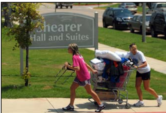
The energy level was high as students moved back into the residence halls.