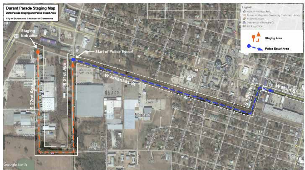
Homecoming Parade Map

Come join us in celebrating homecoming! The line-up route follows Arkansas St. until 12th Ave. "The Future of Southeastern" will meet in the parking lot of Stage. The parade will begin on the intersection of 12th Ave. and Main St. and continue to 1st St. where it will turn left and continue until Beech St.